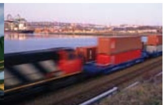
CN double-stack rail service