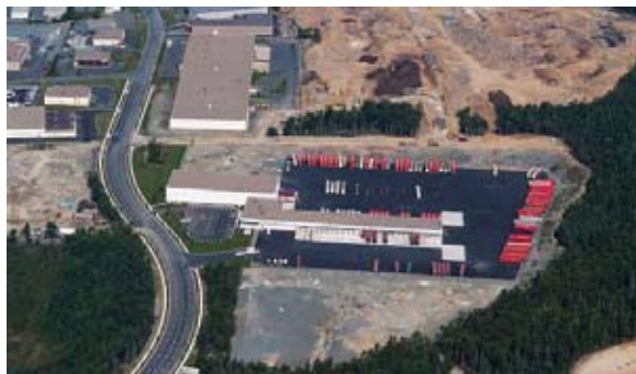
Quick and easy access to everywhere

Phase 2 development comprises approximately 175 gross acres of land diagonally adjacent to Phase 1, with the potential in the area for future development opportunities. Phase 2 has the potential to be rail-served as it lies adjacent to CN's rail line.