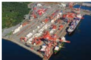
Port of Halifax