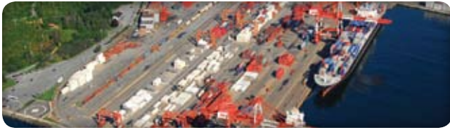
The Port of Halifax has over 1 million sq. ft. of transload, distribution and warehouse space.

The Halifax Gateway is strategically positioned on the east coast of North America. Since the mid-eighteenth century, the region has been a gateway for the movement of trade and people. The Gateway is comprised of the Halifax Stanfield International Airport, the Port of Halifax, 2 container terminals, CN Rail, a strong logistics and warehousing sector and excellent class 1 highway infrastructure.