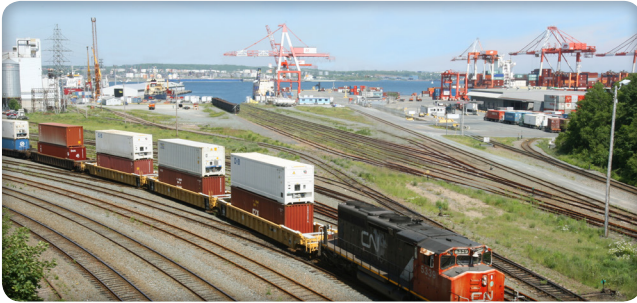
CN ships many different products intermodal, including petroleum and chemicals, grain and fertilizers, coal, metals and minerals, forest products and automotive vehicles. Halifax is also the preferred gateway for food shippers, over other east coast ports.

N orth American Railway, CN, offers competitive transportation solutions designed to meet the dynamic needs of customers from across North America and overseas, and is recognized as a leader in the industry. In order to stay ahead of the other gateways and to offer a superior product to our customers, CN and the Halifax Port Authority , along with Cerescorp Co. Ltd. and Halterm Container Terminal Ltd., recently signed an innovative and comprehensive Service Level Agreement establishing specific performance targets and measurement tools to drive greater efficiencies and improve customer service at the Halifax Gateway.