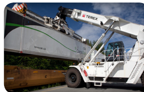
CN Cargo Cool A superior solution for transporting perishable goods. CN Cargo Cool ensures security, visibility and traceability from beginning to end.

CN is driving continuous improvement in performance and has a key handle on reducing its carbon footprint.