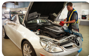
Autoport CN's Eastern Passage Autoport Port Facility in Halifax handles over 200,000 vehicles annually at our 100 acre facility, for import and export.