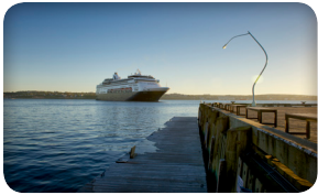
Halifax offers cruise passengers a variety of tour options, diverse cultural experiences, world-class security and unspoiled, natural beauty throughout 3-seasons.